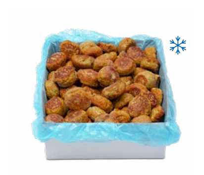
Cod Fish Cakes with Vegetables 90% line caught cod and vegetables, 65 g