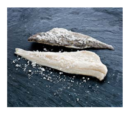
Wet Salted Cod Fillets