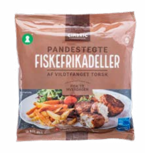
We also offer our products frozen in retail bags