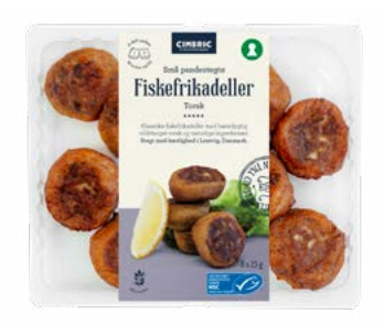
Mini Cod Fish Cakes