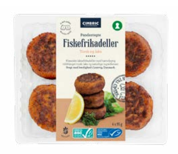
Cod Cakes with Salmon 4x65 g