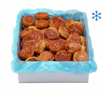
Cod Fish Cakes 90% line caught cod, 85 g