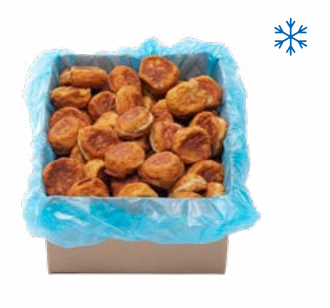
Mini Cod Fish Cakes 90% line caught cod, 25 g