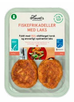
Cod Cakes with Salmon