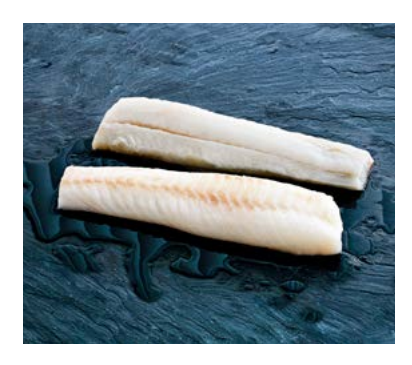
Desalted Cod Loins