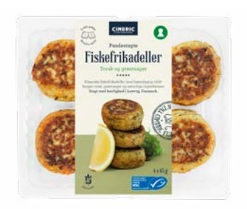
Cod Fish Cakes with Vegetables