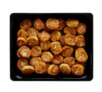
We also offer all foodservice products fresh in Oven-ready trays packed in 2kg