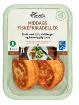
Cod Fish Cakes