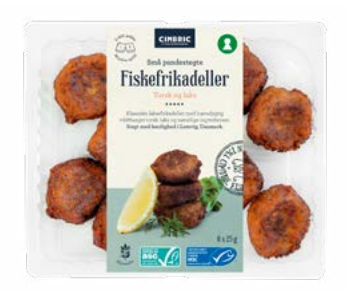
Mini Cod Fish Cakes with Salmon