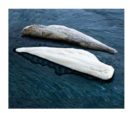
Desalted Cod Fillets