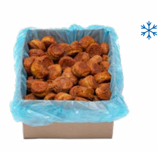
Mini Bio Salmon Cakes Bio salmon and bio vegetables, 25 g