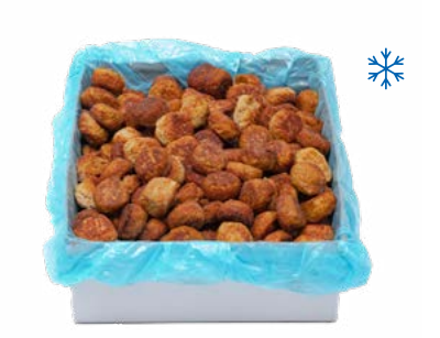
Mini Fish Cakes with Prawns and Chili 82% line caught cod and prawns, 25 g