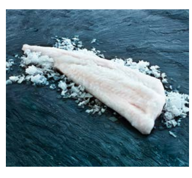
Cod Fillets Light Salted