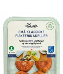
Mini Cod Fish Cakes