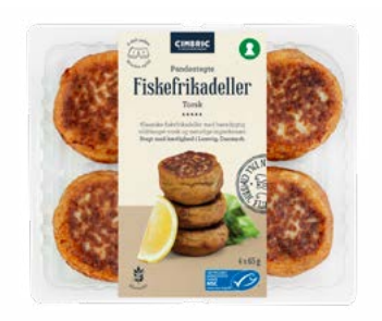
Cod Fish Cakes