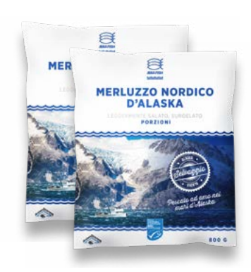
Branded Packaging Available for all products