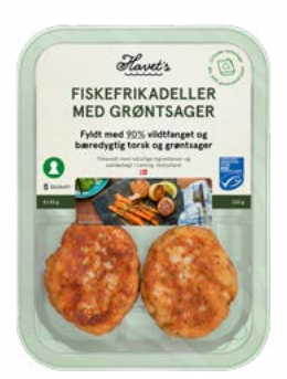
Cod Fish Cakes with Vegetables

90% line caught cod and vegetables, 4x65 g