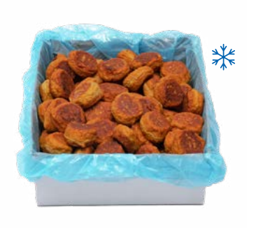
Cod Cakes with Salmon 90% line caught cod and salmon, 65 g