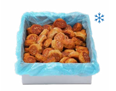
Cod Fish Cakes 90% line caught cod, 65 g