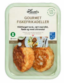
Gourmet Cod Fish Cakes