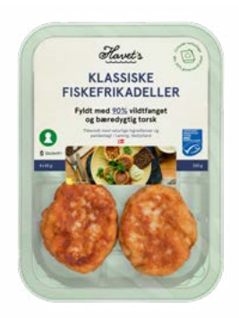
Cod Fish Cakes