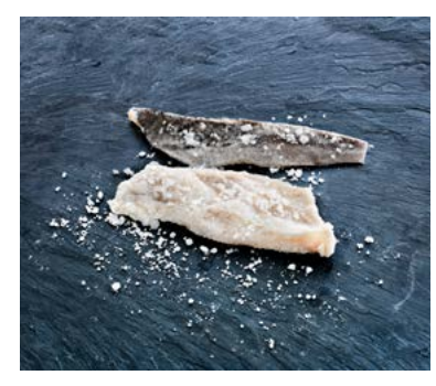
Wet Salted Cod Wings