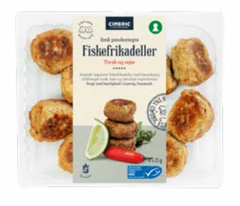
Fish Cakes with Prawns and Chili