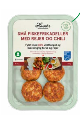
Mini Fish Cakes with Prawns and Chili